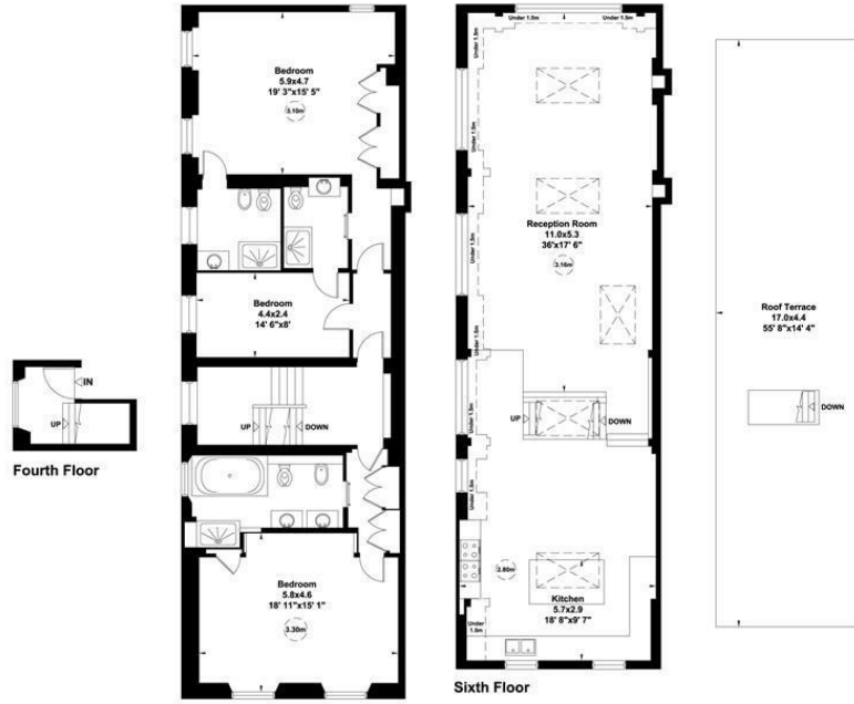
Fifth Floor Not to scale, for guidance only and must not be relied upon as a statement of fact. All measurements and areas are approximate only (and have been prepared in accordance with the current edition of the RICS Code of Measuring Practice).